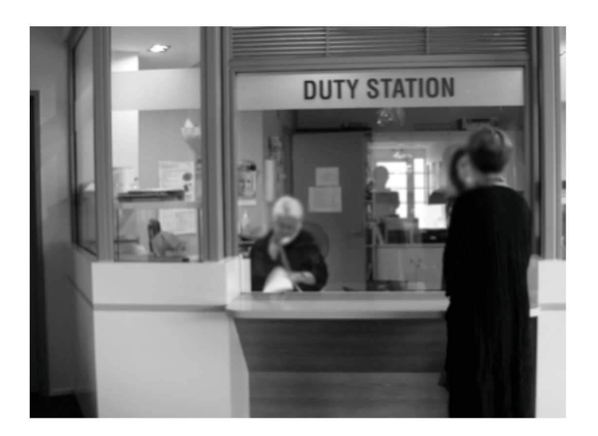
Figure 1: Photograph of Duty Station in HDU

The duty station in the HDU is made up of large panes of glass that wrap around the whole of the station, separating the duty station itself from the ward. At the centre of this wall of glass is one large pane of glass that is not open to the ward (i.e., it cannot be opened like a window) but which has a ledge extending into the ward (see figure 1). To the right of this pane of glass and around the corner - from the point of view of clients inside the ward - is the door to the station, which contains a large window in the top half of the door which also could not be opened.